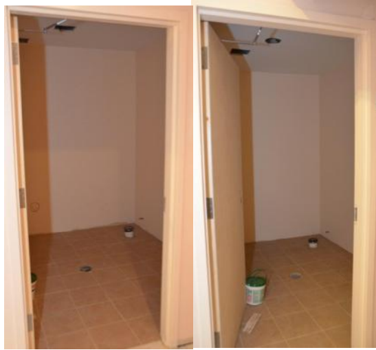
Front lobby facing entry to men's rest room

After 33 days of renovations, the Center is coming along just great! The front of the building has had its' front steps replaced with a gently sloping brickwork. The brickwork was done so carefully. The crew took out the design brick by brick and replaced it in the sloping design.