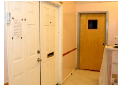
Front lobby facing office entrance

The two restrooms have been enlarged and modernized for handicap accessibility. A separate closet and water fountain have been set up in the lobby area and the doors to the classrooms and office have been modified to ADA requirements.