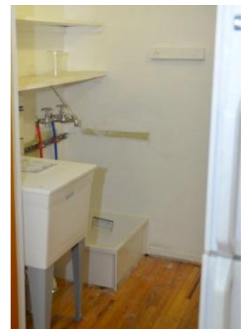
Classroom facing entry to mop closet