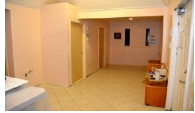
Front lobby facing service panel wall