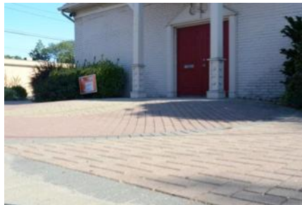
Front entrance patio graded down to sidewalk level

The two restrooms have been enlarged and modernized for handicap accessibility. A separate closet and water fountain have been set up in the lobby area and the doors to the classrooms and office have been modified to ADA requirements.