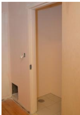
Front lobby facing open door to drinking fountain room