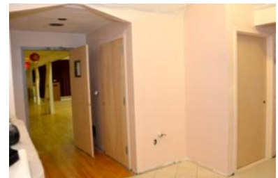
Front lobby facing entry to large assembly room

We are almost there! Pretty soon, the center will open for all activities again.